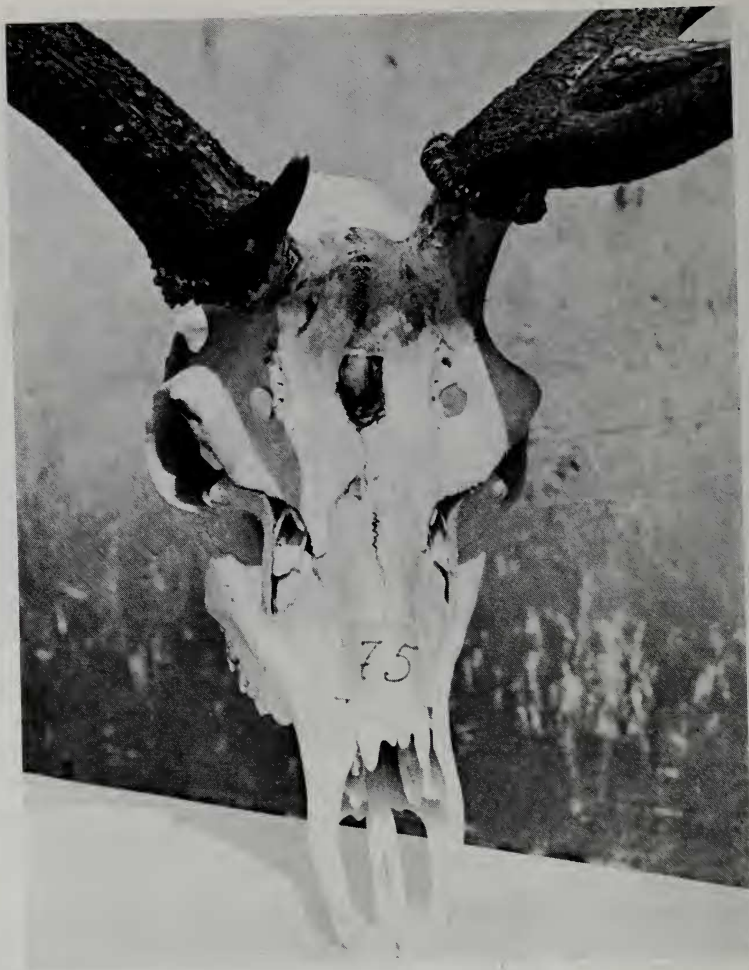
Fig. 4. Skull of red deer stag Rączy II. On the right operated antler a weak brow tine can be seen. Also a very small frontal graft is visible.

process ended on August 9 and on August 14, respectively. Operated antler cast March 26, 1961, 4 points, weight 810 g. Normal antler cast March 26–27, 1961, 7 points, weight 980 g.